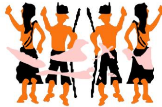
Aliansi Masyarakat Adat Nusantara

The Indigenous Peoples Alliance of the Archipelago (AMAN) established in 17 March 1999. Up to now consists of: 2.596 members communities; ±20 millions in population, 20 Regional Chapters, 113 Local Chapters, 3 Wing Organizations, 2 Autonomous Bodies, 2 Economic Institutions.